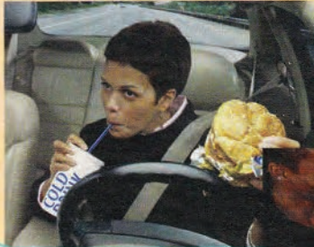
2 drive-through service