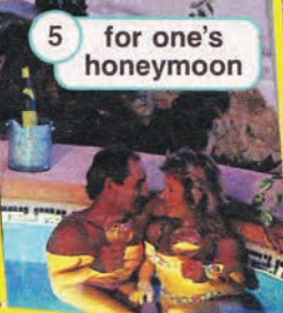
5 for one's honeymoon