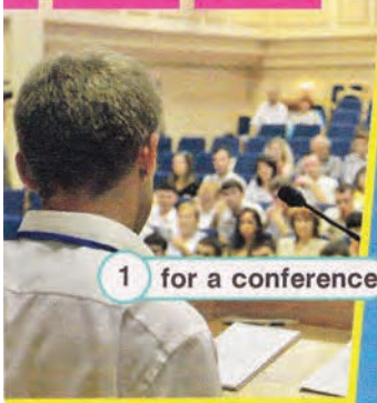
1 for a conference

They also like to see new places. Sometimes people travel to celebrate . For example, some couples travel after they get married. This kind of trip is called a honeymoon . People on their honeymoon are honeymooners . They like romantic places. What are other reasons that people travel?