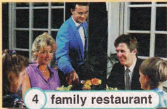
4 family restaurant