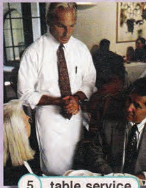
5 table service