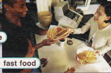
3 fast food