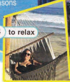
4 to relax