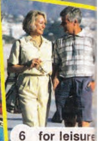
6 for leisure